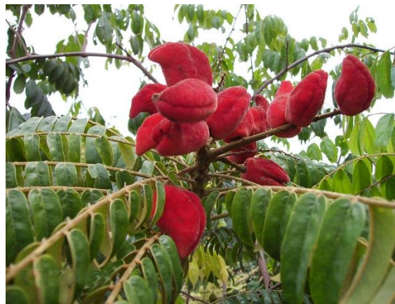
Fig. 1 Habit photograph of Cnestis ferruginea .

Herbal medicines have been widely used and form an integral part of primary health care of many countries (Nair et al. , 2005; Jaafreh et al. , 2019). Nearly all culture and civilizations from ancient times to the present day have depended fully or partially on herbal medicines because of their effectiveness, affordability, low toxicity, and acceptability (Akharaiyi and Boboye, 2010). The health benefits of medicinal plants are attributed in parts, to their unique phytochemical compositions (Okwe and Iroabuchi, 2009; Pulipati et al. , 2016; Oyeleke et al. , 2021) and these secondary metabolites are known to confer protective properties on plants and by and large, have made significant contribution in maintaining human health (Oluwafemi and Debiri, 2008; Igwe, 2007; Jaafreh et al. , 2019) and protect humans against diseases (Ohaeri, 2005; Oyeleke et al. , 2021).